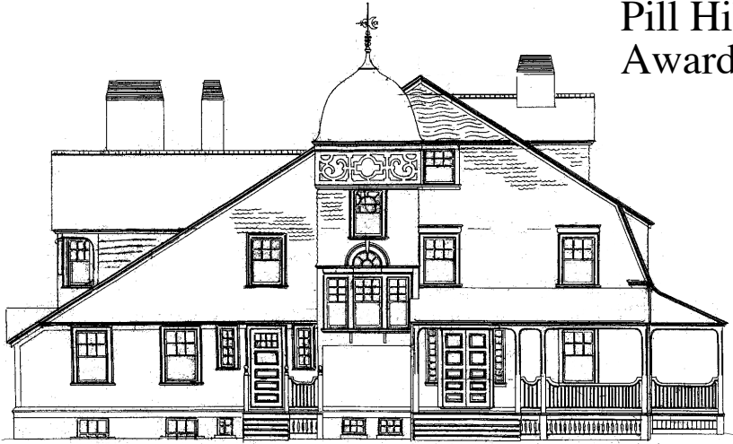
22 Irving Street

We think of the 19th century as that time when the classical tradition that began in the renaissance finally played itself out -- replaced by a grab bag of successively borrowed and blended styles from all places and times. Even as that was happening, and mixed up with it, there was a counter trend, a desire to make a fresh start -- sometimes drawing upon local building techniques and materials to evoke a sense of place and tradition.